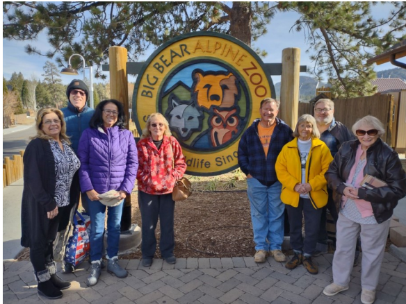
Travel Club found their way to the Zoo in December.