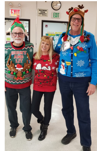
← UGLY SWEATER WINNERS